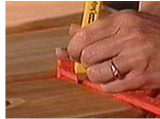
Marking the sides for drilling the peg holes

Lay the two sidepieces out on your work surface. Measure and mark matching pairs of holes on the two 17" cabinet sides. These holes will hold the shelf-support pins.