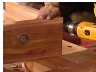
Drilling for the Copper Nails

Clamp the boards in place or use a non-skid vinyl mat, and then drill the holes the right diameter and depth to fit your shelf-support pins.