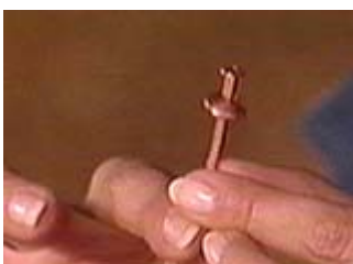
Copper nail with rove

Clamp the boards in place or use a non-skid vinyl mat, and then drill the holes the right diameter and depth to fit your shelf-support pins.