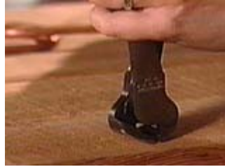
Cutting off the end of the nail using the bull-nose nippers