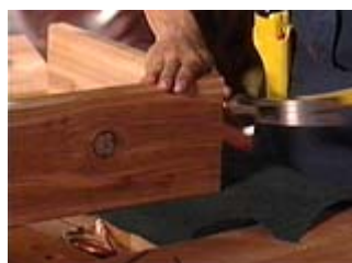
Hammering in the first copper nail