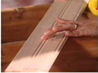
Bead Board example