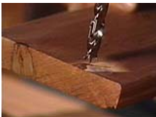
Detail of a Brad Point Drill Bit

Lay the two sidepieces out on your work surface. Measure and mark matching pairs of holes on the two 17" cabinet sides. These holes will hold the shelf-support pins.