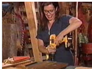
Drilling the Peg Holes