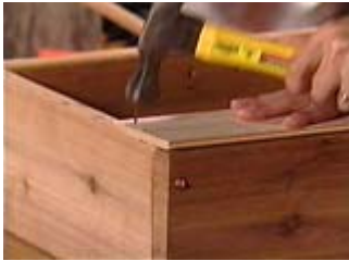
Attaching the Bead Board backing

Center the backing boards on the cabinet frame, and then nail them in place once they're lined up nicely.