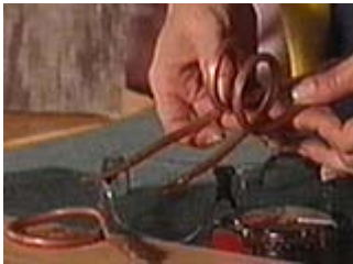
Copper tubing door pulls

Center the backing boards on the cabinet frame, and then nail them in place once they're lined up nicely.