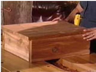
Cabinet assembly with door overhang and side configuration

Attach the handles to the cabinet doors using copper nails. The nails will be too long, so snip the sharp ends off flush with the inside surface of the cabinet door, using bull-nose nippers.