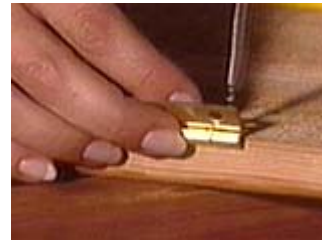
Attaching the hinge to the door

Attach the brass hinges to the cabinet doors, using an ice pick or awl to mark a starter hole for each screw. Use a hand screwdriver rather than a power drill to drive the screws, because brass is so soft it will strip if you use a power tool on the delicate heads.