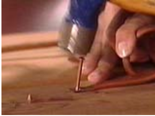
Using copper nails to attach the door pulls