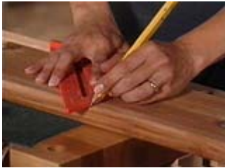
Marking Cedar with speed square