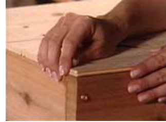
Fitting the Bead Board backing on the frame