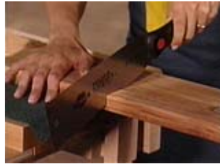
Cutting Cedar with Japanese saw