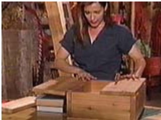
Attaching the doors using a pile of books for support

Attach the brass hinges to the cabinet doors, using an ice pick or awl to mark a starter hole for each screw. Use a hand screwdriver rather than a power drill to drive the screws, because brass is so soft it will strip if you use a power tool on the delicate heads.