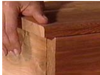
Detail of cabinet assembly with door overhang