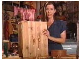
The finished cabinet

Now attach the hinged doors to the cabinet. Use a pile of books to hold the door level while screwing on the hinges, and try to create a slight gap between the inside edges of the doors so they don't bind on each other. If they do bind, plane the inside edges using a hand plane, or coarse sandpaper.