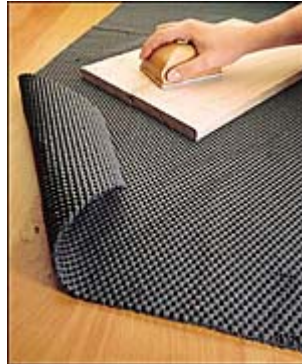
Non-skid vinyl mat