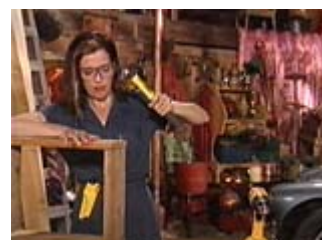
Hammering in the last copper nail

Pre-drill and then nail each corner of the cabinet frame together, using copper nails. Use a speed square to make sure the cabinet is square. If not, reef on it to pull it into alignment.