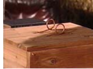
The copper door pulls attached

Attach the handles to the cabinet doors using copper nails. The nails will be too long, so snip the sharp ends off flush with the inside surface of the cabinet door, using bull-nose nippers.