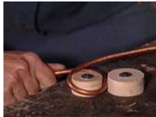
Making the door pulls using a round jig

Make cool handles out of flexible copper by bending the tubing around a cylindrical object (even a jar works fine). Then, using a ballpeen hammer, or even just a regular hammer, pound the tube-ends flat on a hard surface (the flat top of a vise works well if you don't happen to have an anvil).