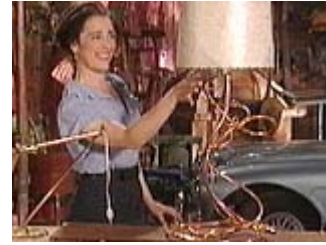
Mag with finished lamp