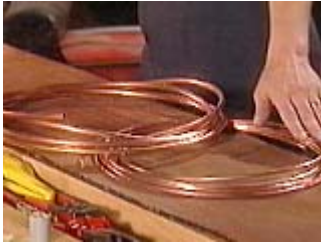
Flexible copper pipe comes in many sizes