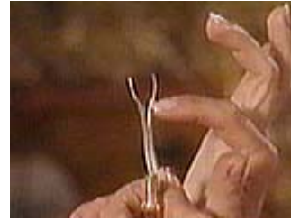
Strip the wires back three quarters of an inch