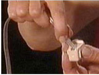
Slide the housing on first