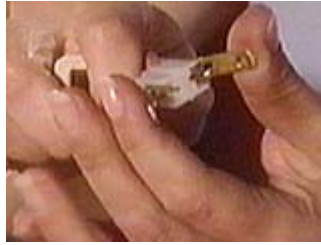
Squeeze the plug ends together puncturing the cord and making the connection