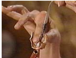
Tape the wire to the end of the string and pull the wire through the pipe