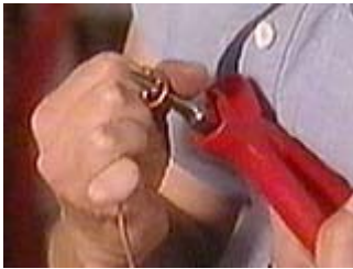
Use needle nose pliers to bend light gauge wires

Flag it with a piece of tape so you remember NOT to drill into it.