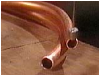
Tie a nail to the end of a string and drag the nail through the pipe with a strong magnet

After the tube has cooled, remove and discard the hose clamp.