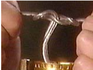
Tie an Underwriter's knot to fit in the base of the socket