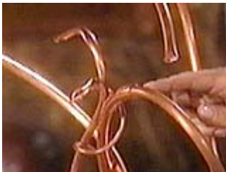
Some smaller copper pipes will fit snugly inside larger ones

Stretch different diameters of flexible copper tubing into a sinuous, vine-like assembly. Use a pipe cutter to cut the tubes to the same height.