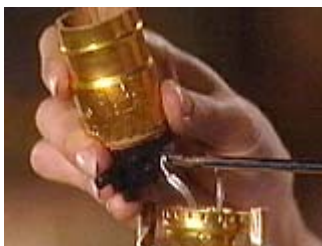
Attach the wires to the screw terminals

Strip each of the two wires back about three quarters of an inch. Give exposed wires a clockwise twist to stop them from splaying. Tie an underwriter's knot and pull the knot down into the base of the socket.