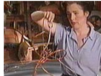
Feed the wire in at the top and pull it through with the string