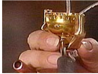
Tighten the set screw on the socket base