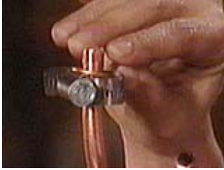
Place a fluxed copper washer over the hose clamp, then the harp base and another copper washer