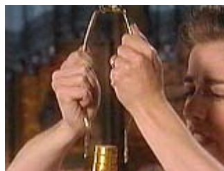
Install the harp

Lamp cord has ribbing (sometimes only one raised rib) along one side and is smooth on the other. Attach the side with the ribbing to the socket's silver screw terminal. The smooth side goes to the brass screw.