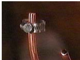
Install a hose clamp about one half inch down from the top