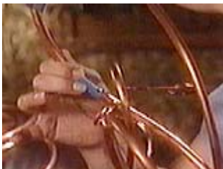
Use emery paper to remove oxidation prior to soldering

Using needle nose pliers, curl lengths of copper wire into tendrils. Use the tendrils to bundle the copper 'stems' together. This stabilizes the vertical trunk of the lamp.