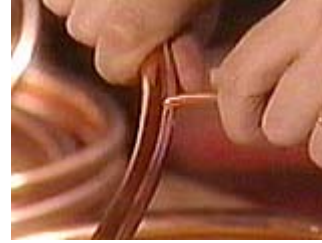
Insert the smaller pipe in the drilled hole and give it a sharp bend to hold it in place

Drilling into the tubing leaves sharp burrs on the inside edge of the tubing. Burrs can cut into lamp cord, leading to electric shock.