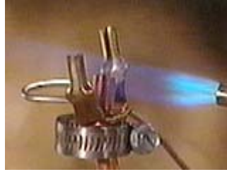
Always heat the pipe from one side and apply the solder from the other side

Place a sanded and fluxed copper washer on top of the hose clamp. Place the base of the harp on top of the first washer, then add the second sanded and fluxed washer.