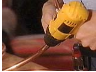
Drill holes in the larger pipe to help attach the smaller ones