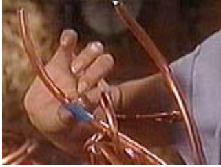
Mark the pipe that will carry the electrical wire so as not to drill into it