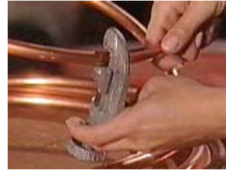
Cut the pipe off with a pipe cutter