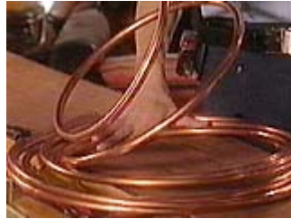
Stretch the flexible pipe up to the desired height while leaving enough for a sturdy base