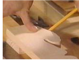
Trace all four corners

Lay the boards out to determine how you want the corners to fit together. Place the boards so that the side pieces fit inside the top and bottom pieces (this way the screws won't show when you screw them together).