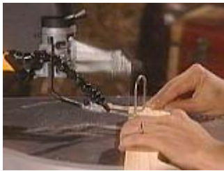
Carefully cut along the scribed lines

Place the sides on the table first and the top and bottom on top of them. Use a carpenter's square on the outside edges so that the frame is square. At the corners, trace the wavy pattern of the top and bottom pieces onto the side pieces.