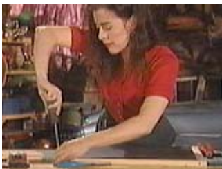
Attach the clip and mirror with small brass screws

Repeat, making one clip for each corner.