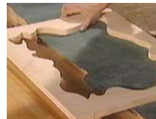
Place the frame on a non-skid mat for routing

When the joints are as good as they can be, clamp the pieces together. While the glue is still wet, sand the surface and the dust from sanding will fill any open gaps and be held in place by the glue. Let the glue set up overnight. Remove the clamps.