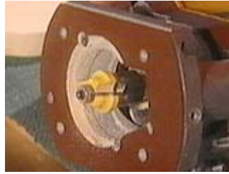
Choose a router bit with a guide wheel on the bottom