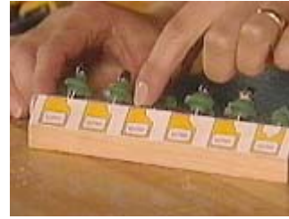
There are many types of bits to choose from