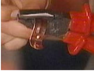
Cut a copper plumbing clamp in half to fashion a mirror clip