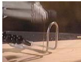
Cutting to a drawn cut-line