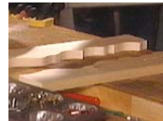
The first completed cut

Cut the boards for the four frame pieces larger than the desired outside width and height of the finished frame because you'll need extra room for cutting the wavy joints.