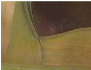
Close-up of a curved joint cut with a scroll saw

Work freehand - draw cut lines on the board and attempt to follow them with the saw.