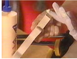
Use carpenters glue on both sides of the joint