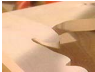
When finished, the joint should fit snugly together

Go back to your scroll saw and carefully cut along the lines drawn on the side pieces. The more precise your cuts are, the tighter the joint will fit when you glue the pieces together.