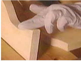
Apply glue to the joint