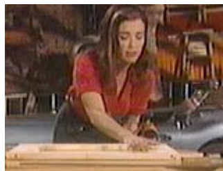
Screw the corners together from the top and the bottom for added strength