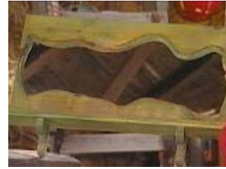
Mag's first mirror finished with aniline dyes

Set up the saw at a height just below eye level so that you can see easily while standing and making cuts. Be sure to have a good source of light from two directions so that shadows don't obscure the view of the blade. Practice with some scrap wood to get the feel of the saw. Play with the tension on the blade and with different blades.