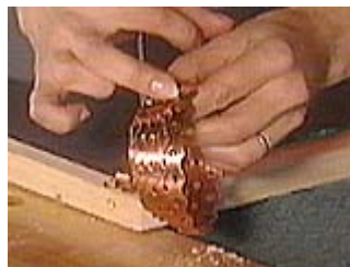
Attach pre-drilled copper plumber's tape to the back for hanging