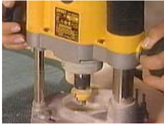
Use a router to give a decorative edge to the inside of the frame