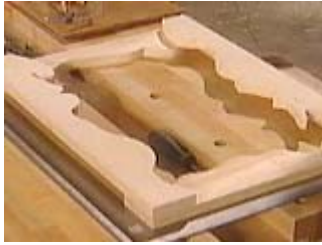
Place the top and bottom pieces on top of the sides and use a square for alignment