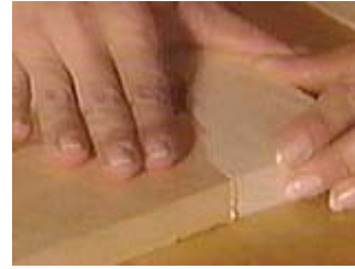
Push the pieces together