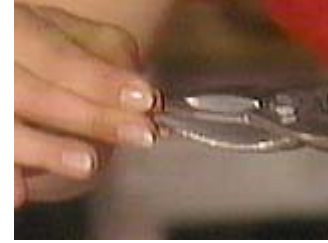
Cut and bend once more so that it will fit over the corner of the mirror

Either cut the mirror yourself with a glass cutting tool, or have the mirror cut to the size necessary to cover the opening in the frame. Attach it with clips to the back.