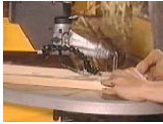
Close-up of scroll saw