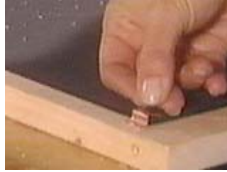
Bend it in a Z shape to fit over the mirror