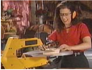
Mag demonstrating a scroll saw