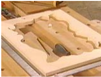
Use the square for alignment

After cutting, place the pieces on a flat surface and check the joints for accuracy. As long as most of the surface is touching, the frame should glue together quite well. Apply glue to all the surfaces that touch. There should be eight surfaces total.