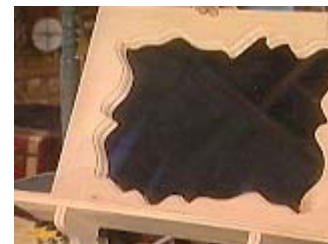
Finished mirror with shelf and brackets

Attach the glass with the clips. Drive 1/2" pan-head brass screws through each pre-drilled hole to hold the clips firmly in place. To hang the mirror, cut two pieces of copper plumber's tape about two inches long. Attach them to the back of the mirror frame with brass screws. Leave enough of the tape free at one end that it can be hooked over the head of a nail or screw in the wall. Take a glance in the mirror and reflect on the beauty and originality of asymmetry.