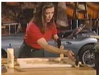
Clamp and let the glue dry overnight

Then, put the pieces in place and check their position using the square.