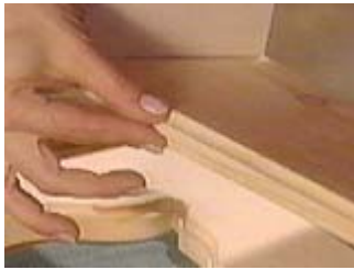
Rout the top and the bottom edge of the shelf

All routers are different and so it is important to follow the manufacturers directions in using them so, read up or get a lesson from an experienced router enthusiast. Next, cut a shelf out of one by six pine. The shelf should be about two inches longer than the width of the frame. Rout the edges on three sides. If desired, the edges can be routed from both the bottom and the top giving an unusual but perky look.