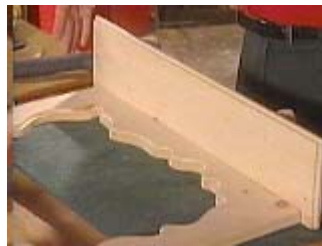
Center the shelf under the mirror and attach it with screws

Make two brackets to fit under the shelf using the scroll saw and router. Rout the edge of the brackets from both sides to look like the shelf. The brackets should be about five inches square before you scroll them into a traditional 'S' shape.