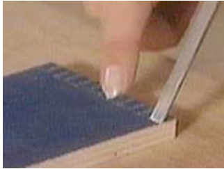
Place the chisel just in front of the scribed line