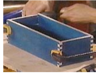
Clamp and let dry overnight