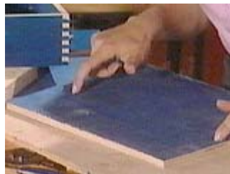
Cut along the traced line