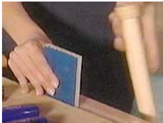
Clamp it in place

Use a ruler and pencil to mark the teeth on the ends of each board. Use a square to make saw-guide lines on the butt end of the board. Turn the board on edge and mark each of the teeth that are to be removed and the ones that stay. Put an 'X' on the ones that go.