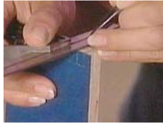
Mark across the end of the board