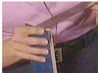
Alternately, measure the thickness of the wood with a precision ruler