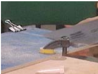
After staining, cut out the pieces

Prepare the plywood by first sanding and staining with aniline dyes or a stain of choice. The dyes can be premixed and then refrigerated. Mark them as poison, tape the top and keep them out of the reach of children.