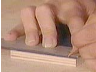
Mark for all of the teeth