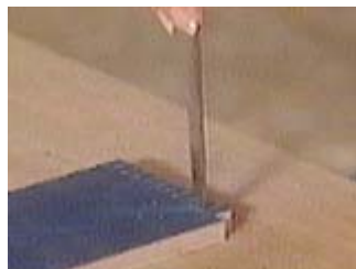
Finish from the other side