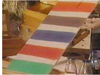
Mix the pure colors together for unlimited variation

Prepare the plywood by first sanding and staining with aniline dyes or a stain of choice. The dyes can be premixed and then refrigerated. Mark them as poison, tape the top and keep them out of the reach of children.