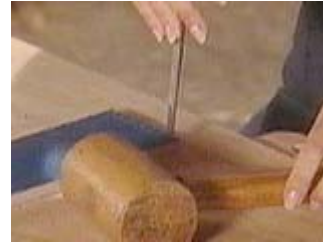
Mallet used to strike the handle of the chisel

Use the appropriate sized chisel to start the cut along the scribed line. Place the chisel just to the inside of the line with the flat side against the wood.