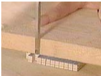
The block keeps the chisel vertical and the sand paper prevents slipping

When the chisel is in place, hit it with a mallet and cut down into the wood part way. Then turn the wood over and cut again from the other side. This will give you the cleanest possible cut, with no splintery slivers.