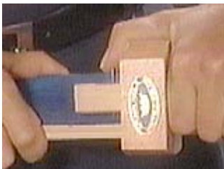
Draw the scribe along the end of each piece on both sides