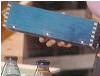
Add copper nails for a secure bottom

Make sure the bottom fits well and then pull the pieces apart and lay them out in order for easy gluing. Put some glue in a dish and use an artist's brush to apply glue to all sides of all the joints. Assemble all at once and clamp together. Let it cure overnight.