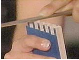
Use a file to clean up the joints