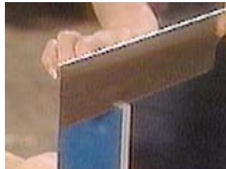
Cut down to the scribed line at each of the marks

Use a fine toothed back saw to make cuts along the lines down to the scribed line. Japanese backsaws that cut on the pull stroke are easiest to use.