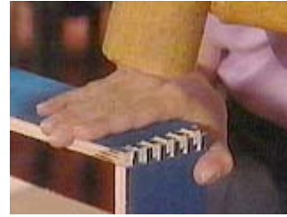
A good tight joint requires a mallet to tap the pieces together