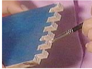
Brush glue on all the surfaces of every joint