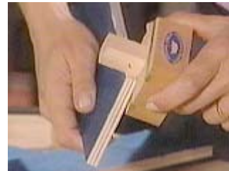
Set the depth to the thickness of the wood you're using