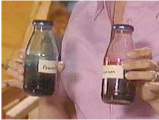
Aniline dyes are mixed in water, stored in jars marked 'poison', and refrigerated