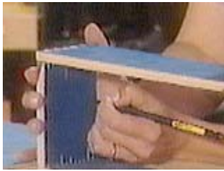
Mark the pieces in order

Once all the teeth have been chiseled out, clean any stray splinters out of the joints using a bastard file. Dry fit the joints. Move the pieces around and try them in different positions until you've achieved the best possible fit.