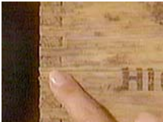
Box joints on an antique box