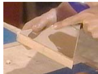
Use a thick piece of wood with sand paper attached to one side as a guide for your chisel