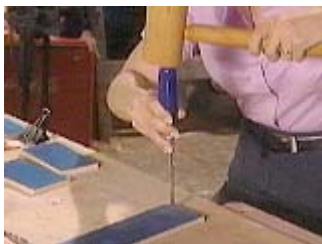
Start with a small cut on one side

Use the appropriate sized chisel to start the cut along the scribed line. Place the chisel just to the inside of the line with the flat side against the wood.