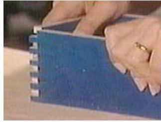
Dry fit the joints and choose the best fit