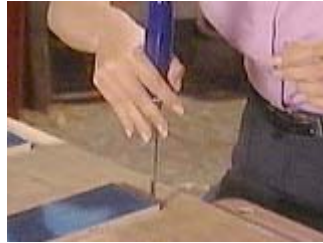
Hold the chisel like this for more stability