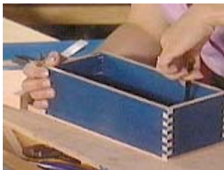
Place the box over a corner of spare plywood and trace the inside edge of the bottom dimension

Give each of the pieces a discreet number so that when you're doing the final assembly with glue, all the pieces go together in the right order.