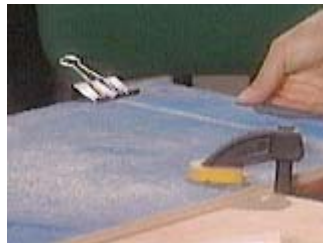
Use a binder clip to help stabilize the loose end while cutting