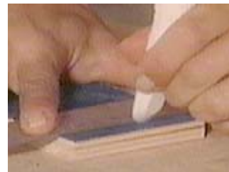
Transfer that size onto the wood and mark with a pencil or chalk

Determine the depth of the box joints. It will be the width of the plywood or 3/8" deep. Scribe that depth using a carpenter's scribe, or a ruler and very sharp pencil or even a chalk marking-tool from your sewing kit.