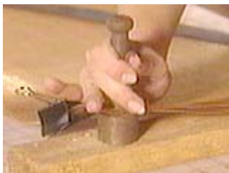
Place the female grommet piece on top