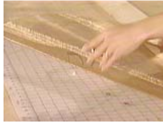
For a cutting surface, use a plastic fabric-cutting mat or a piece of plywood