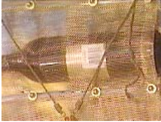
Completed wine rack with a bottle

Once you've opened holes for all 10 lines of tube and hardware, start inserting tubes and fastening them in place with the hardware. Tighten the hardware using two tools at once - a hex head driver to hold the acorn nut on one side of the screen, and a screw driver to tighten the screw head on the other side.