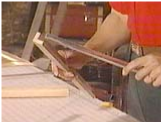
Build a 90 degree wooden jig

Cut ten 1' pieces of polycarbonate tubing, using a fine-toothed saw.