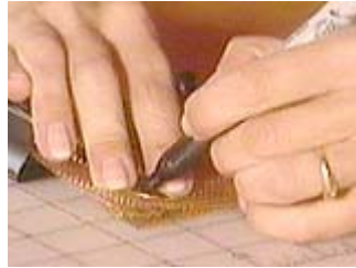
Mark for the grommets

Lay out the 2 hemmed pieces of bug screen, one on top of the other. Square them. Clip the edges together with binder clips.