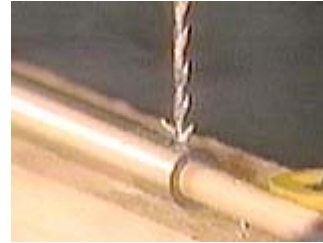
Start with a small bit and increase to the desired size