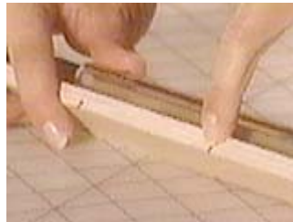
Measure and mark the jig at the drill points