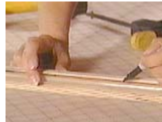
Use the jig to mark the tube

Make an L-shaped jig by nailing together two 14" pieces of trim lumber.