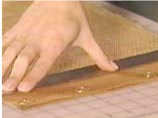
Mark screen with marker for placement of tubes and holes

Remove the set; if it's stuck, pry it loose with a small screwdriver.