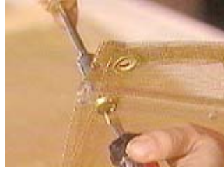
Snug up the hardware - don't over-tighten