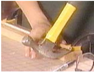
After drilling, use a hammer to pry the tube and doweeling up

Nail the dowel through the drilled holes to a scrap piece of lumber. Now the tube is snug and stable so you can drill the holes without it rolling.