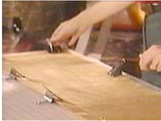
Square the two pieces of bug screen and clip them together with binder clips