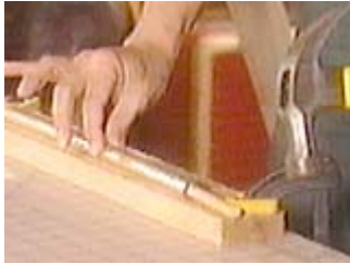
Nailing the dowel and tube down stabilizes the tube for drilling