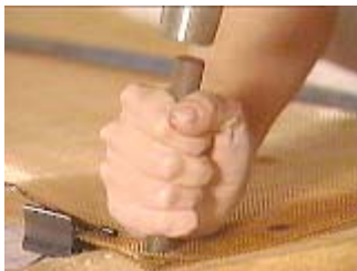
Place the punch over the mark and strike it with a hammer until it has pierced all layers of screen

Put 4 grommets along the top edge, and 4 along the bottom edge.