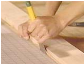
Use a putty knife and the straight edge to bend the screen up

Using a rotary knife, cut two pieces of screen measuring 14 1/2" x 63". To make sure you get a nice even line with your knife, use a straight edge as a guide.