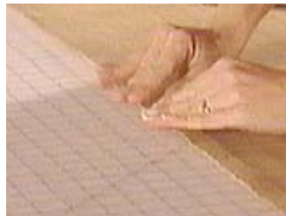
Continue the bend using your fingers