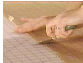
Press it down again using the putty knife