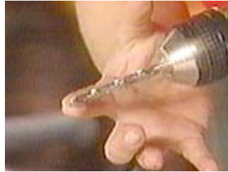
Drilling holes in plastic requires a special drill bit