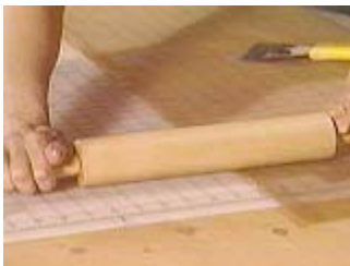
Use a rolling pin to burnish the crease

Use a putty knife to bend the screen up 3/4" at each edge. Then make a hard crease in the screen with the putty knife. Give it a final pressing with a rolling pin. Repeat these steps again so you have a double fold.