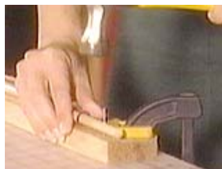
Drill holes in the ends of the dowel and nail them down to make a clamp

Insert a 14" piece of 3/8" dowel into the 5/8" tube.