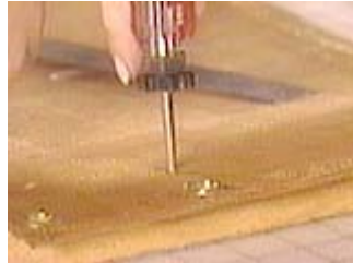
Push an awl through the screen and into the drill holes on the wooden jig

On the bug screen, mark for placement of the tubes, and also for where the screen needs to have holes that match the holes in each tube.