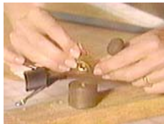
Push the male half of the grommet through from the bottom and place it on the seat