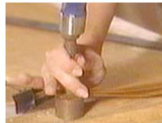
Insert the setting tool and strike with a hammer