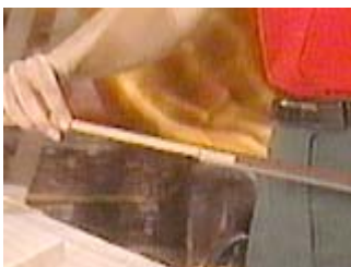
Slide a tightly fitting dowel into the hollow tube

Using the same jig, make marks on the tube corresponding with the marks you made on the jig - at 1/2", 4", 8" and 11 1/2".