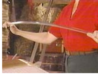
Polycarbonate tubing is more flexible than other types of tubing (i.e. acrylic)

Cut ten 1' pieces of polycarbonate tubing, using a fine-toothed saw.