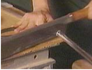
Cut the polycarbonate tubing to length with a fine-toothed saw