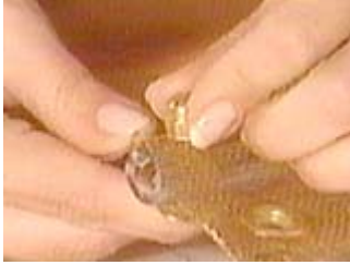
Slide the tube in between the layers of screen, line up the holes and install the hardware