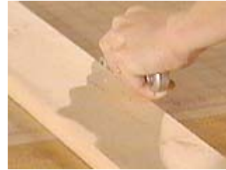
Use a piece of wood or other straight edge as a guide for the rotary knife

Using a rotary knife, cut two pieces of screen measuring 14 1/2" x 63". To make sure you get a nice even line with your knife, use a straight edge as a guide.