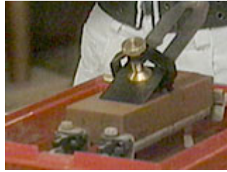
Use a jig to hold the blade fixed while sharpening