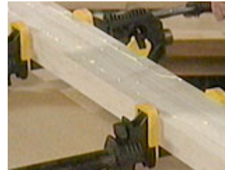
Snug the clamps up and adjust as necessary