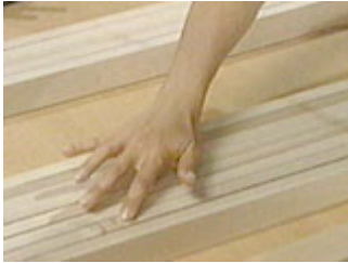
Sort the boards putting knots down