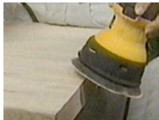
Soften the sharp edge with an orbital sander

Now sand all surfaces with an orbital or belt sander. Start with coarse grit sandpaper, like 40 or 60. Once you've got the surface smooth, move up through the grits of sandpaper to 80, 100, 120 and up as high as you like. I went to 600 but I'm a sanding geek.