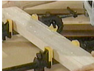
Place the boards in the pipe clamps and even up the ends