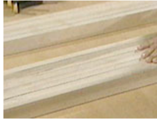
The top should be even and clear of knots