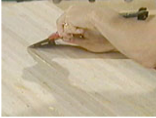
Glue the five larger pieces together and scrape off the excess glue

Repeat the process for each clump of five boards until you have five units of five. Now glue all five units together using the same clamping technique. Let the glue set up for at least twenty minutes, then unclamp your cutting board.