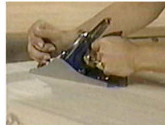
A jack plane will also do a great job