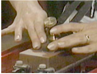
Sharpen the blade of a new plane on an 800 grit water stone