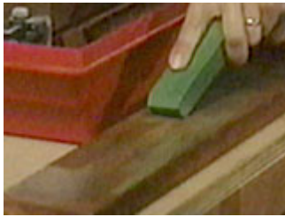
Apply honing compound to a leather strop to finish