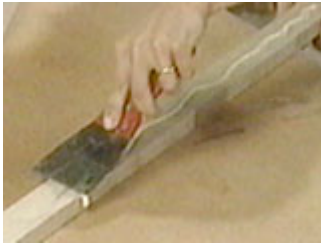
Apply glue on each side that touches another

Now take the first five boards and set the rest aside. You have to glue in units of five because the glue will dry faster than you can work.