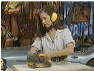
Sand using progressively finer sanding belts

Once you've planed both surfaces, trim about 1/2" off each end using a circular saw (or a handsaw if you want nice deltoid muscles).