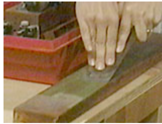
Strop both sides of the blade