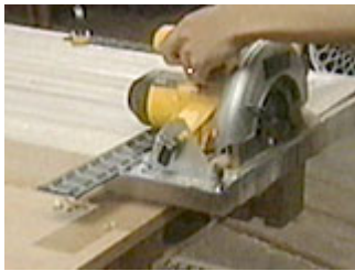
Use a circular saw to trim the ends