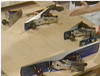
08 - Starting with larger planes will provide a flatter surface

At this point it's probably not looking good. Some of the boards are sticking up and there are yellow rivulets of dried glue everywhere including on your shoes. This is normal.