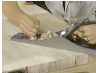
A large plane will provide the flattest surface