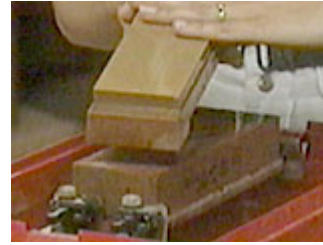
Finish on a 1200 grit water stone