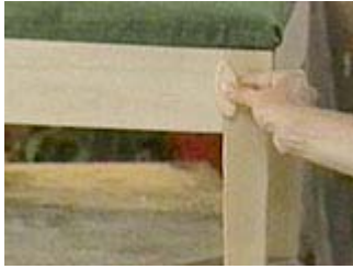
Where the biscuit fits in the joint