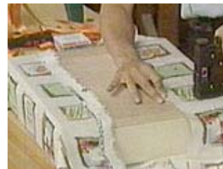
Then staple the other