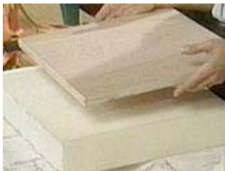
Plywood and foam

While the pieces are still clamped, cut four identical corner braces to fit in the corners around the legs. When the pieces are screwed in place they will brace the legs as well as providing a way to attach the top to the frame. Drill perpendicular holes in each pointed end of the brace and counter sink them. The hole drilled in the brace should be LARGE enough that the screw can slip through it BUT the hole in the apron (where the screw attaches) will have to be SMALL enough to catch the threads. Also, be careful not to burst through the front of the apron when drilling with the smaller bit. Attach the corner brace using 2" screws. Note: leave 1/4" to 1/2" between the brace and the top of the ottoman so that there is room for the fabric.