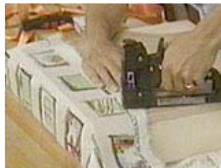
Staple the material on one side