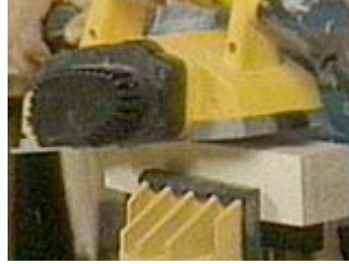
Finish going with the grain

Clamp the leg securely and use a power planer to remove the excess wood to within 1/16" of the taper line. Continue planing the inside edges of all four legs.