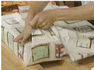
Make a nice fold in the corner and staple it in place