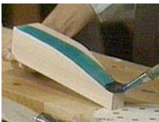
Brush on in one long stroke

Once all the surfaces are sanded to your liking, apply a finish of powdered aniline dye mixed with clear, de-waxed shellac . Both aniline dyes and shellac are available at Lee Valley Tools. The shellac should be mixed to about a 1 lb cut (i.e. One pound of dried shellac flakes to one gallon of shellac thinner or de-natured alcohol - BUT NEVER MAKE THIS MUCH AT A TIME! It's only good for a few months once it's mixed, so make small batches.)