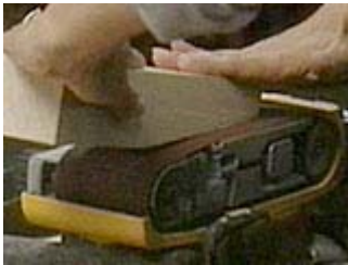
Sand the pieces smooth

Tip: It is easier to start planing the larger part of the taper first from the bottom up. This will, however, cause the wood to chip because of the direction of the grain. After you have gotten your planed line parallel to the pencil line and about 1/8th inch away, reverse the direction and plane from the top of the leg down. This will help to take out any chips that you might have made going against the grain.