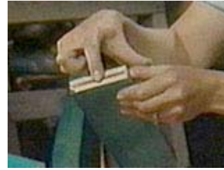
Slot made for the biscuit in the end of an apron piece