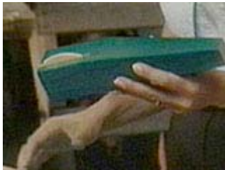
Biscuit in place in the side of the leg

Determine the size of biscuit to be used (see your machine's instructions) and set the biscuit joiner to that size. Adjust the blade of the joiner so that it will cut a slot right in the center of the apron board where it joins the leg. Be sure your joiner is unplugged while working close to the blade making adjustment! Once everything is lined up, cut slots in all the ends of the apron pieces.