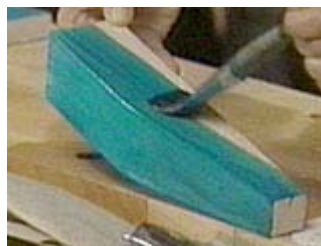
Overlap the brush strokes a tiny bit