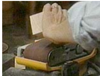
Ease the sharp edges last