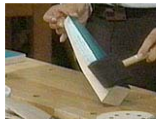
Remove any excess quickly with a dry sponge brush

You'll have to experiment with the aniline powder mixed into the shellac to get just the right depth of colour. I used about one quarter of an envelope of Peacock Blue aniline powder in approximately a half-pint of liquid shellac. The great thing about making your own aniline finish as opposed to using paint or even stain is that the intense dyes bring out the grain and iridescent quality of the maple.