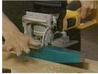
Cutting a slot in a leg