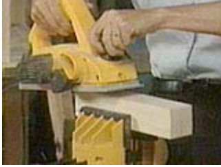
Begin planing against the grain on the thick end of the taper