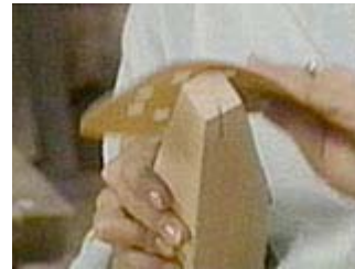
Complete the sanding by hand as necessary