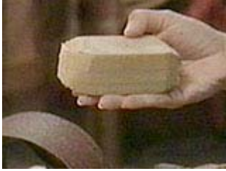
Sanding belt eraser