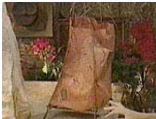
Free standing twig and paper lantern

My lamp turned out looking like an evil alien pod. The kind of rice paper I used didn't help. The myriad little dark red fibers look exactly like blood vessels when lit from within. Organic, yes, but it frightens children.