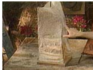
Small twig and paper lantern on wooden base