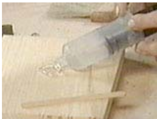
Cement branches in place with epoxy

With a sharp knife, carve the ends of the branches to fit the shape of the holes before gluing them in. Also, to ensure that the epoxy will make good contact with the inside surfaces of the hole, blow out or vacuum each of the holes to remove the stone dust.