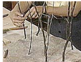
Hold the twigs steady with some craft wire while the epoxy sets up

Next, mix up the epoxy and glue a curly willow branch into each of the holes using epoxy. Also, wear latex gloves to keep the epoxy off your hands because the hardening compounds in it can be corrosive to skin. Use some fine wire to tie the branches together while the epoxy sets up; it'll keep them upright. Clean up any glue squeeze-out with acetone or nail polish remover. You can also spread some of the drilling dust on the tacky squeeze-out to disguise it.