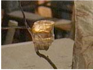
A votive candle added