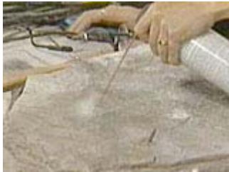
Blow or vacuum out the holes before gluing