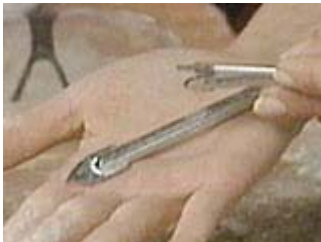
Glass-and-tile drill bits

The bit you use should drill easily into the stone