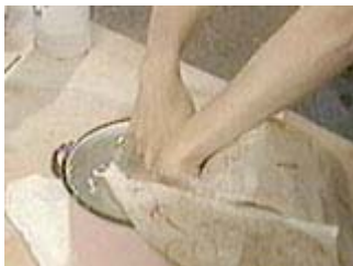
Wet the paper

Next, mix up the epoxy and glue a curly willow branch into each of the holes using epoxy. Also, wear latex gloves to keep the epoxy off your hands because the hardening compounds in it can be corrosive to skin. Use some fine wire to tie the branches together while the epoxy sets up; it'll keep them upright. Clean up any glue squeeze-out with acetone or nail polish remover. You can also spread some of the drilling dust on the tacky squeeze-out to disguise it.