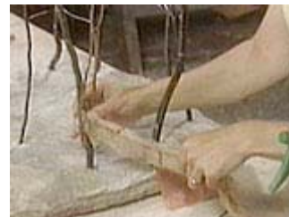
Glue the strips to the twigs

Wet your rice paper and tear off strips, paying attention to the direction of the grain in the paper. It'll want to rip easily in one direction, but not the other. Apply a bit of diluted white glue (about a 50/50 glue/water mix) to one end of a strip and wrap the paper around one of the vertical branches. Stretch it as far as it can go around the other sticks and glue it in place. Be sure to leave a space between the paper and the stone so that air can get to the candle, which will reside inside the paper enclosure.