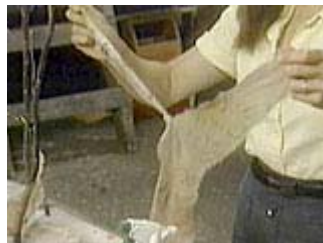
Tear it into strips