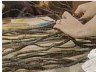
Curly willow makes a twisty interesting frame for the paper

With a sharp knife, carve the ends of the branches to fit the shape of the holes before gluing them in. Also, to ensure that the epoxy will make good contact with the inside surfaces of the hole, blow out or vacuum each of the holes to remove the stone dust.