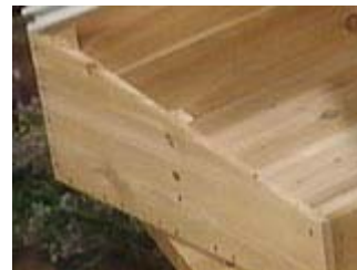
Detail of finished side

Attach the angled sides to the frame with screws through the back and one more through the tip of the angled board. Add a vertical brace in the center of the each side and secure it in place with screws through both boards.