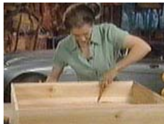
Mark the final flooring piece that will require cutting