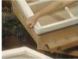
The box will be smaller than the window so that the rain will drip off