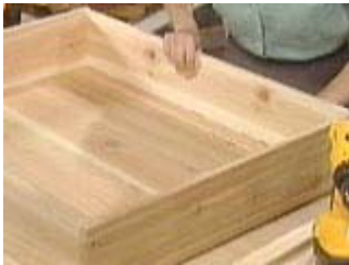
Screw the first layer of the frame together, and put floor in place

Build a box that measures approximately 2" smaller than the overall dimensions of your window. This allows a bit of overhang on the front and sides.