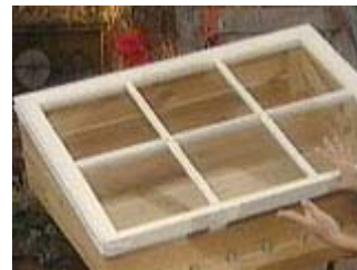
Completed box with window

Make an arm (to hold the window open while working inside the box). Drill one 1/4" hole through the three layers: the side, the vertical support and the arm itself. Pass a carriage bolt through the hole in the side, place a washer on the bolt and then pass the bolt through the support arm. Add another washer and finally a nut. Use thread adhesive to lock the nut in place leaving the arm a bit loose so that it can move freely and easily.