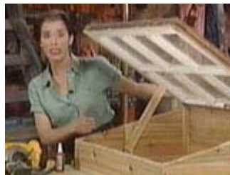
Cold frame with support arm installed