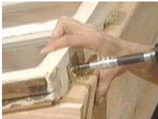
Pre-drill and screw the hinges and window together

Remove old hardware from the window, then prime and paint any exposed wood. Attach three hinges to the back of the frame, then attach the window to the hinges leaving equal overhang on both sides.