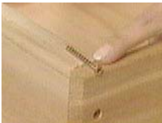
Use a screw long enough to get a good grip on the end grain

To build the first layer of the box, pre-drill and screw the sides to the front and back. Use the stronger, thicker decking boards for the back to provide extra strength where the window will be hinged. Then attach the front.