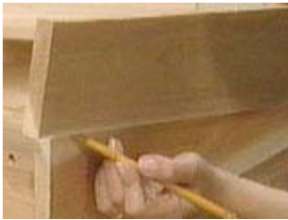
Use a straight edge to scribe the cutoff angle

Attach the 1" x 2" corner braces to the inside back of the frame using 1-1/4" screws. Then screw the top board to the corner braces to complete the back.