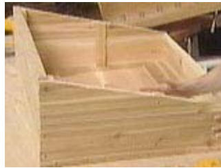
Cut the side piece and install it with screws

Make the angled sidepieces by holding a 24" fence board on top of one of the existing sides. Use a straight edge to draw the angle from the top back down to the level of the front. Cut one angled board for each side.