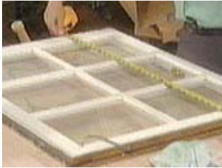
Measure the window in both directions