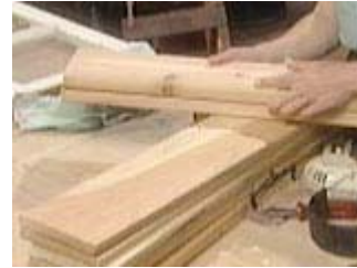
The back pieces are thicker than the sides and bottom