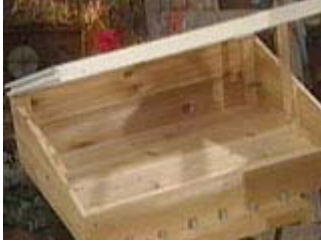
Lid propped open

But here's the thing. Don't plant your tomato seeds too early or they'll be ripe earlier than anyone else's and then they'll be gone earlier than anyone else's and then next winter is going to seem even longer.