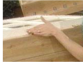
Choose best side of window for hinging