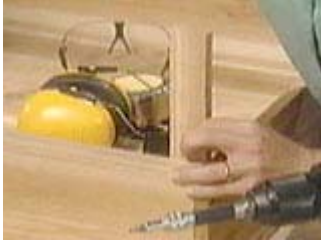
Install a vertical brace in the corner