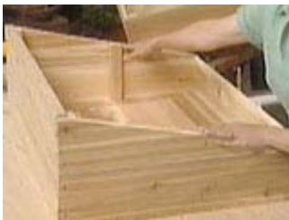
Install a brace in the centre of each side for added support

Make the angled sidepieces by holding a 24" fence board on top of one of the existing sides. Use a straight edge to draw the angle from the top back down to the level of the front. Cut one angled board for each side.