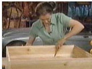
Mark the final flooring piece that will require cutting