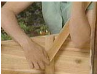
Install a support arm for the window

Remove old hardware from the window, then prime and paint any exposed wood. Attach three hinges to the back of the frame, then attach the window to the hinges leaving equal overhang on both sides.