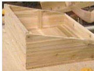
Completed box without window