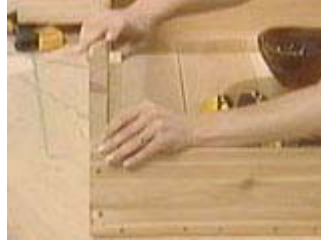
Attach the second level to the brace

Attach the 1" x 2" corner braces to the inside back of the frame using 1-1/4" screws. Then screw the top board to the corner braces to complete the back.