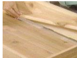
Install the piece in the bottom

Once the first layer of the box is screwed together, set the bottom pieces in place. If there is a large gap in the floor, lift the frame and slide a board in place under it. Then use a pencil to trace a cut line to custom fit that last board. Cut and slide the board back in place and attach all the floor boards with screws through the sides. (Be sure to pre-drill before driving in the screws.)