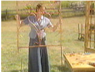
Slide the trellis over half inch re-bar set in ground

Flux and clamp the overlapping ends of the copper strapping with Vise-Grip pliers, then solder.