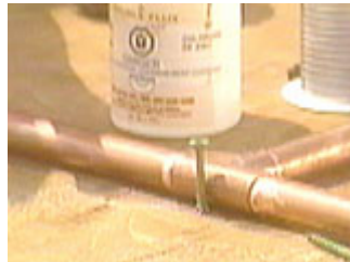
Use screws to help hold the pieces in position for soldering