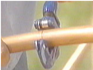
Cut it to fit with a pipe cutter

Draw a trellis design on paper. Note the rough dimensions and sizes of tubing you intend to use. I suggest sturdy 3/4" tubing for the outside frame and 1/2" everywhere else. You'll need fittings ('T's and 'unions') at every joint. When you've figured out the design details, transfer the drawing full-scale to a plywood tabletop (or sketch it out on the driveway with chalk).