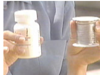
Use flux and leaded solder from a stained glass shop