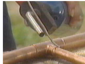
When it's hot enough, the solder melts and flows into the joint