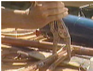
To solder - Clamp the pieces together

Lay the decorative curls inside the frame and secure them to each other by wrapping the contacting points with rounds of copper wire. Secure the wired units to the outer frame with copper plumber's tape or copper strapping.