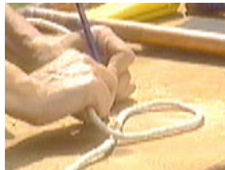
Mark the length on the sash cord