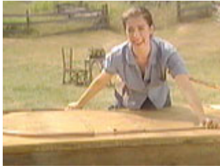
Use a smaller pipe to gently straighten the ends so that the fittings slip on