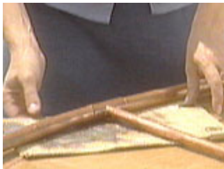
Place a plumber's fire proof mat under the joint to be soldered

You can tell when the joint is hot enough to accept solder by touching a length of solder to the metal on the far side of the joint. If the joint is hot enough, solder will melt instantly and flow between the metal surfaces wherever flux has been applied.