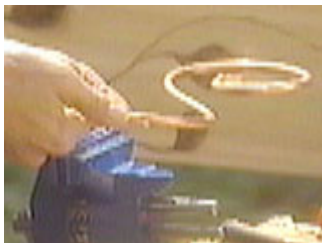
Pinch the end of the tubing in a vise and then form the shape with your fingers

Form the shapes first with a piece of sash cord. Then use the rope mock-up to determine the length of pipe to cut. Clamp one end of the cut tubing in a bench vise, working curves into the copper with your fingers.