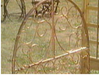
Detail - top of the small trellis