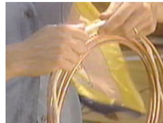
Transfer the length to the tubing