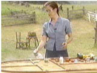
Cool the joint with a spray of water