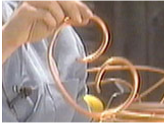
C- shape detail