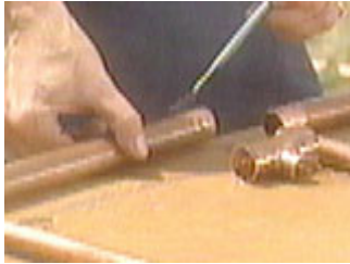
Brush the solder on the outside of the tubing