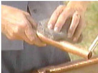
Steel wool will quickly clean the tubing, removing manufacturer's info

When you have everything fitting together happily, get ready to flux and solder.