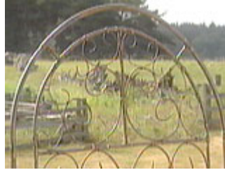
Detail - top of large trellis