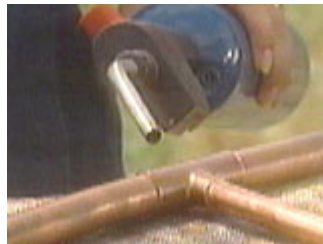
Use a plumber's torch to heat the joint