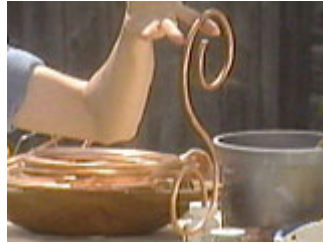
S- shape detail