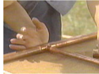
Push the pieces firmly together

You can tell when the joint is hot enough to accept solder by touching a length of solder to the metal on the far side of the joint. If the joint is hot enough, solder will melt instantly and flow between the metal surfaces wherever flux has been applied.