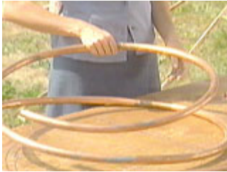
Flexible three-quarter inch copper tubing