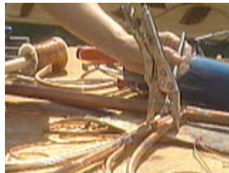
Flux from the outside