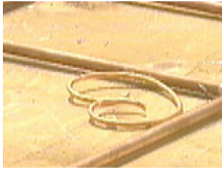
Placement of C