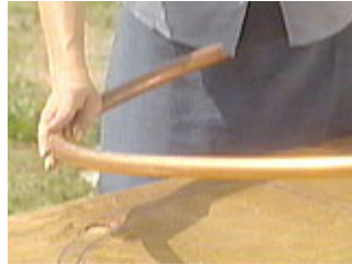
Bend the flexible three-quarter inch tubing to fit the drawing