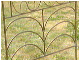
Detail - bottom of large trellis