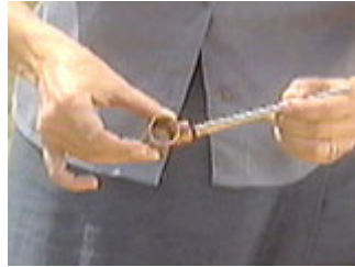
Brush the flux on the inside of the fittings