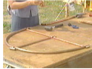
Cut all the pieces to fit the drawing