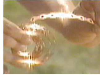
Or plumber's tape

Lay the decorative curls inside the frame and secure them to each other by wrapping the contacting points with rounds of copper wire. Secure the wired units to the outer frame with copper plumber's tape or copper strapping.