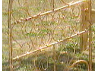
Detail - centre of the small trellis