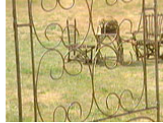
Detail - centre of large trellis