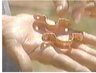
Make fasteners out of plumbers strapping