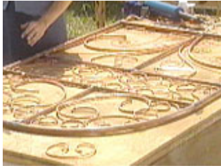
Place all the shapes