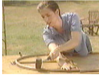
Use a rubber mallet to take the waves out