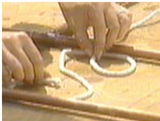
Use sash cord to help determine the length of tubing to cut

Using smaller gauges (3/16" to 1/4") of flexible tubing, make the decorative 'C' and 'S' shapes to form the lacy design inside the frame.