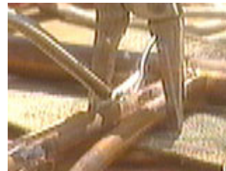
Heat the metal thoroughly before applying the solder

Flux and clamp the overlapping ends of the copper strapping with Vise-Grip pliers, then solder.