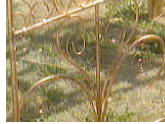
Detail - bottom of the small trellis